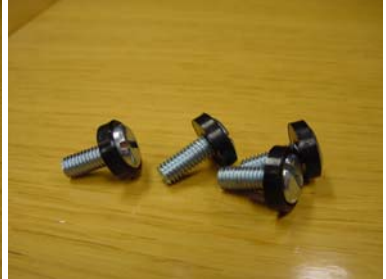
Rack mount bolts (not supplied)

Note: For the Vega 400 there are left and right handed rack mount brackets.