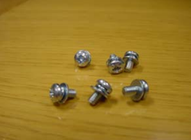
Bolts with washer and lock washer