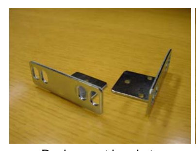
Rack mount brackets